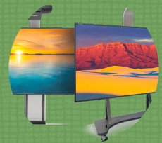
Champions and Community Partners