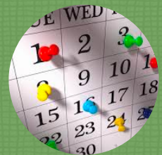
Calendar of Events